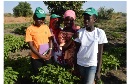
Members of the Toubacouta 4-H Club, a pilot club

is an outreach program that encourages youth development, youth entrepreneurship, and agricultural education in social and economic life. Thanks to the foresight of the USAID-funded Education and Research in Agriculture program (ERA), 4-H is providing the optimal platform for youth in Senegal to gain life skills, agropreneur skills and STEM literacy. Participants discover ways to make good decisions; manage resources wisely; work effectively with others; and to communicate effectively. In March 2015, three pilot clubs were established in Toubacouta, south of the capital of Dakar—marking the first time a 4-H club has been established in francophone Africa.